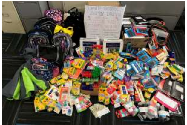
School supplies collected at the 640, 670 Lacey buildings, Maple Park and WorkSource Thurston.

Schoolhouse, visit online at www.redschool.org . Thanks to all ESD staff who contributed and who are dedicated to care for our community in need!